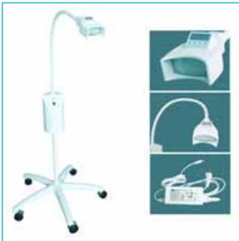
Express LED Lamp