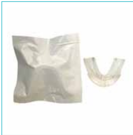
Preloaded Whitening Tray Carbamide Peroxide 18%