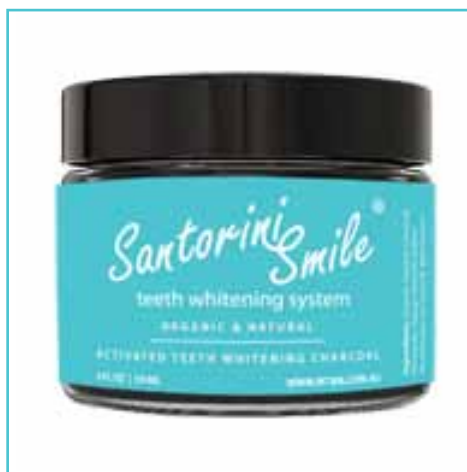
Santorini Smile™ Activated Teeth Whitening Charcoal