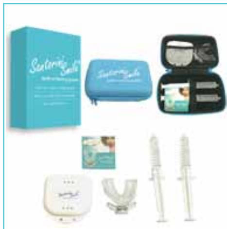
Santorini Smile™ Teeth Whitening Box