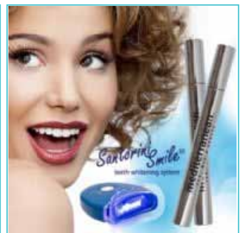
Santorini Smile™ Complete Take Home Collection