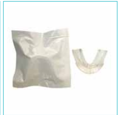
Preloaded Whitening Tray Hydrogen Peroxide 6%