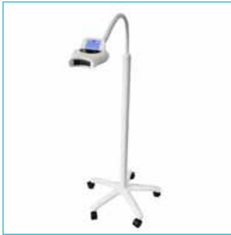
Professional Teeth Whitening LED Lamp