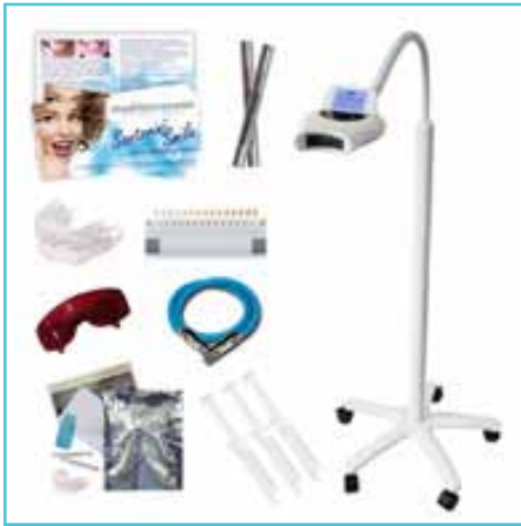
Santorini Smile™ Teeth Whitening Salon Investment Deal 2