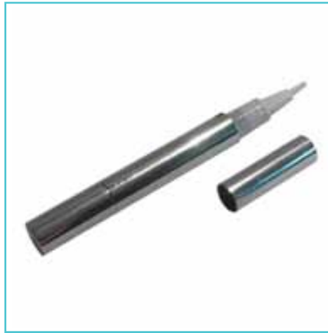
Whitening Pens Hydrogen Peroxide 6%