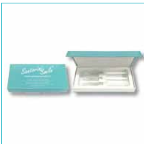
Santorini Smile™ Refill Gel Kit