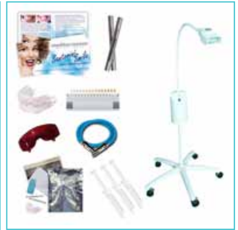
Santorini Smile™ Teeth Whitening Salon Investment Deal