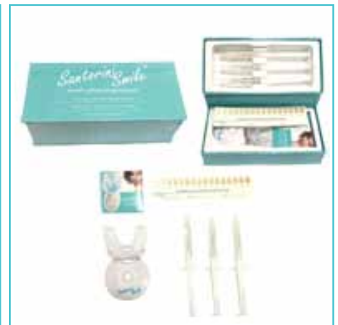
Santorini Smile™ Teeth Whitening System