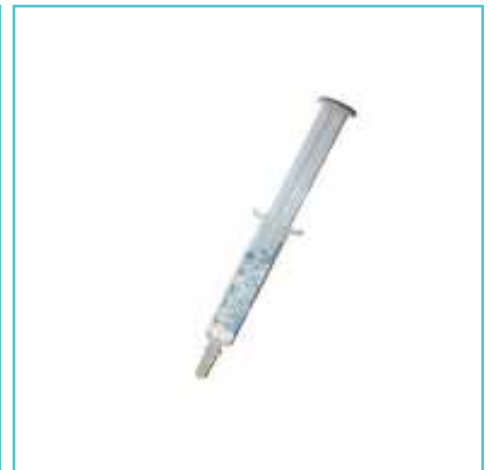
Syringes Hydrogen Peroxide 6%